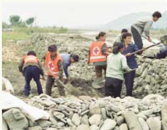
Building resilience: community working together to reduce flood risk North Korea

There are many entry points whereby bilateral donors can promote disaster risk reduction in international and national development agendas.