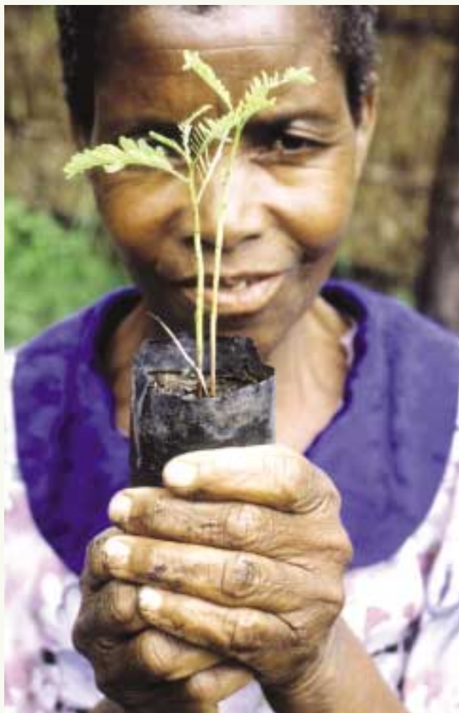
Reducing the risk: woman working on reforestation project

Humanitarian responses to disaster impacts now cost Development Assistance Committee (DAC) donors an annual US$ 6 billion or seven percent of total official development assistance (ODA) flows, and this proportion is rising. Yet disaster-related costs to development run much deeper than this.