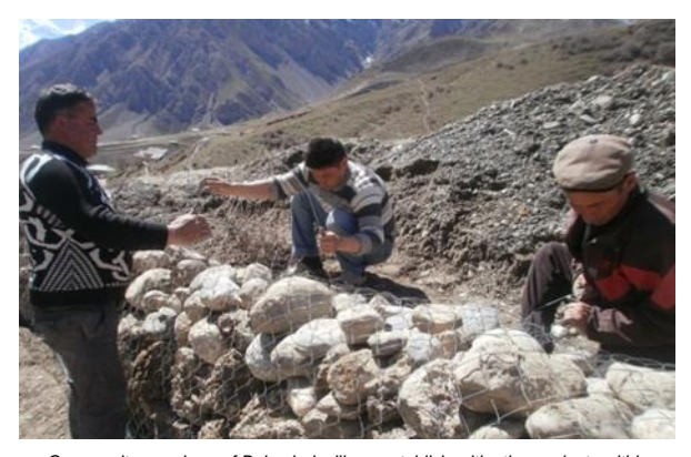
Community members of Bobuchak village establish mitigation projects within the village, Sughd Province, April, 2015

In addition to these measures, local safe havens were identified within each village that will be stocked with equipment and supplies for use by community members. Further, as these projects were implemented using only community resources, these mitigation projects will act not only to secure Bobuchak village itself, but the projects will act as examples to be replicated by other villages at risk of similar natural hazards.