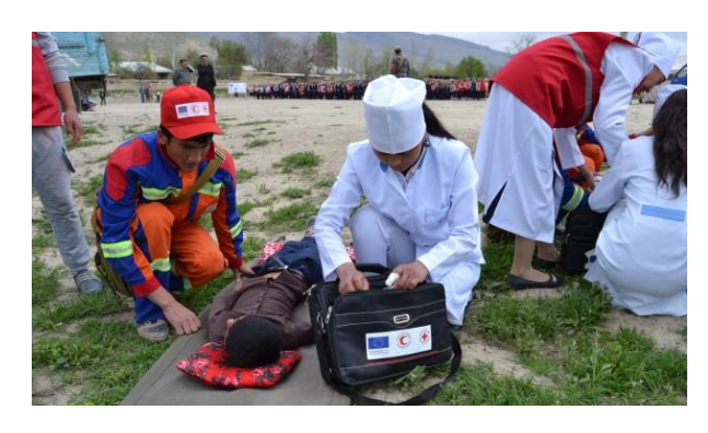
Community level practical simulation exercise, Sughd Province, April 17, 2015

The simulation involved more than 600 participants including school children and group of Emergency Situation services.