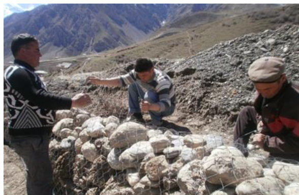
Community members of Bobuchak village establish mitigation projects within the village, Sughd Province, April, 2015

All manual work was done by community members using locally sourced materials (stones, seedlings, shrubs, wire).