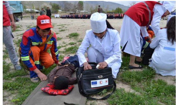
Community level practical simulation exercise, Sughd Province, April 17, 2015

The simulation involved more than 600 participants including school children and group of Emergency Situation services. Active participants were awarded with the prizes at the end of the event.