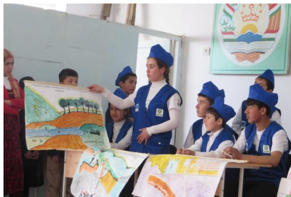
Schoolchildren of Khovaling district are asking the questions during the competition, Khatlon Province, April 16, 2015

Schoolchildren from 10 schools of the Kulyab Zone took part at the competition held at Secondary School Number Four, from April 16 to 20, 2015. The programme for the TV competition included: introduction to teams, reading of poems on Disaster Risk Reduction, plays on promoting Safety Measures during Emergency Situations, as well as questions and answers. Winners of the competition were awarded with various valuable prizes.