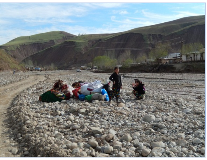
Displaced family in Shuroobod. Photo by REACT RRT, April 2014

National Commission of Emergency Situations is establishing final assessments of needs. According to preliminary information up to date, the below priorities have been identified: