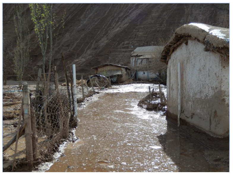
Affected household in Shuroobod. Photo by REACT RRT, April 2014