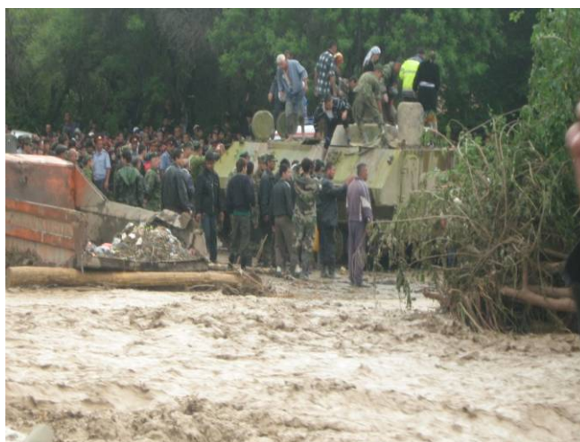
Evacuation of population in Kulob district.

<click here for the DREF budget, here for contact details, or here to view the map of affected areas>