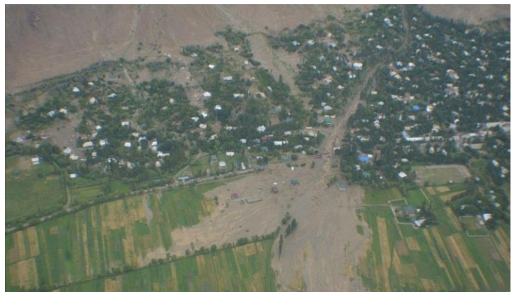
Mudflow in Barushon village, Rushan District, GBAO, July 21, 2015

As CoES reports, the water level increased in Bartang river at 42,47,56,58,81,85,109,117 km of Rushan – Bartang highway. Moreover a mudflow occurred in Bartang and Barushan Jamoats which affected a number of households. Based on preliminary information 5 houses severely damaged and 5 are partially damaged in Bardara village. The road is blocked in Bartang Jamoat (Khijez, Siponj, Razuj, Ajirkh, Chadud, Yapshorv, Ghudara villages) and the population is in isolation at the moment (please see the map). The number of houses and agricultural land were also damaged in Barushan Jamoat.