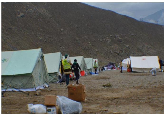
Tent camp for affected households in Shugnan District, GBAO, July 19, 2015

The President assigned the government agencies to coordinate relief and response operations in the areas affected by mudflow and surrounding districts. Local authorities have allocated land for construction of the houses for 83 affected families in Shugnan District. The construction of new houses for around 70 households has already started and laying of water pipe from the channel to the camp is ongoing. However, people at the affected site, whose houses were not affected and who was not evacuated (in Barsem and Berdibekobod villages), do not have access to drinking water and currently rely on drinking water that the volunteers from the communities are bringing.