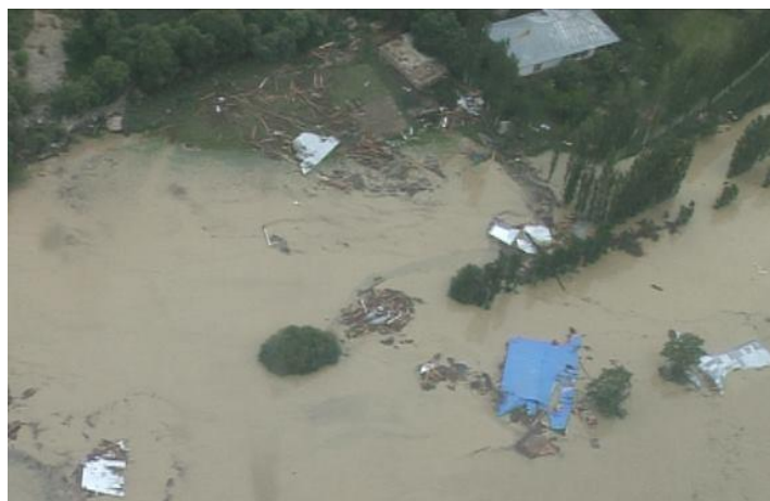
Flood affected area in Shugnan District, GBAO, July 19, 2015

An artificial lake, occurred following the glacier melting and flow of mud coming from the mountains, in Kolkhozobod village (Suchan Jamoat), has increased for around 20cm. Based on information received from CoES the total number of affected households is 81. Out of that 69 are completely destroyed and 12 more are partially damaged. As the water flowing from the valley erodes the land and destroys more houses over time the number of the damaged houses is continuously growing. Joint commission of Main Department of Geology, CoES, FOCUS and other government agencies are conducting