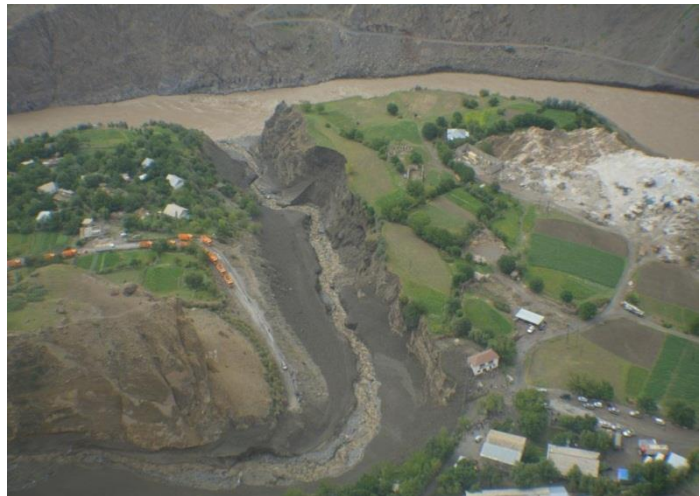
Mudflow in Lugad village, Vanj District, GBAO, July 21, 2015

Mudflow affected the villages of Rokharv (Rokharv jamoat), Tekharv (Tekharv jamoat), Baravn and Lugad (Vodkhud jamoat), Rog and Pshikharv (M.Abdulloev jamoat). A mudflow killed 6 persons (5 persons are resident of Vanj District and 1 person is resident of Shugnan District), destroyed a number of houses and damaged the irrigation lands, bridges and roads. Currently the affected households are temporary hosted by their relatives. The figures on number of affected people and damages have not been provided yet, as the State Commission assessment is still underway. The communities have no electricity since the disaster occurred. A group of volunteers (local residents) set up a temporary response team to clean the road from debris, as well as monitor and respond to possible disasters.