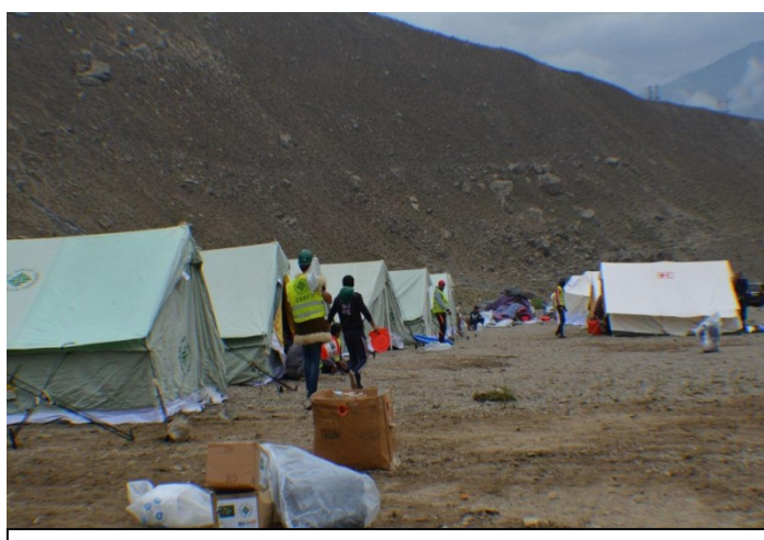
Tent camp for affected households in Shugnan District, GBAO, July 19, 2015

The President of the country has assigned relevant government agencies to coordinate relief and response operations in the areas affected by mudflow and surrounding districts. Local authorities have allocated land for construction of the houses for 83 affected families in Shugnan District. The construction of new houses for around 70 households has already started and laying of water pipe from the channel to the camp is ongoing. However, people at the affected site, whose houses were not affected and who was not evacuated (in Barsem and Berdibekobod villages), do not have access to drinking water and currently rely on drinking water that the volunteers from the communities are brining.