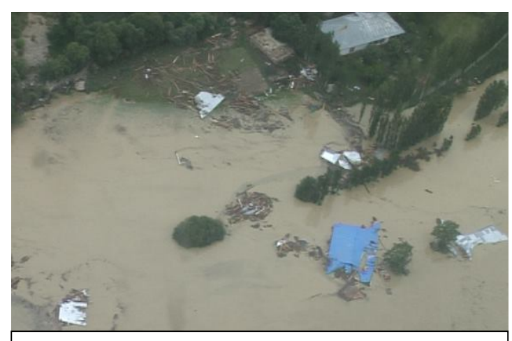
Flood affected area in Shugnan District, GBAO, July 19, 2015

Water level in the artificial lake, occurred following the glacier melting and flow of mud coming from the mountains, in Kolkhozobod village (Suchan Jamoat), has increased 20cm. Based on information received from Committee of Emergency Situations (CoES) total number of affected households stands at 81. Out of this, at least 70 have been considered as completely destroyed and 16 more are partially damaged. As the water flowing from the valley erodes the land and destroys more houses over time the number of the damaged houses is continuously growing. Joint commission of Main Department of Geology, CoES, FOCUS