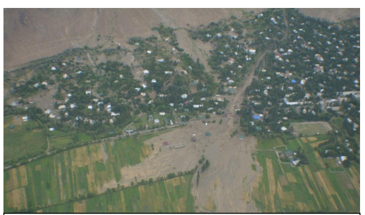
Mudflow in Barushon village, Rushan District, GBAO, July 21, 2015

As CoES reports, the water level increased in Bartang river at 42,47,56,58,81,85,109,117 km of Rushan - Bartang highway. Moreover a mudflow occurred in Bartang and Barushan affected Jamoats which а number households. Based on preliminary information five houses severely and five more partially damaged in Bardara village. The road is blocked in Bartang Jamoat (Khijez, Siponj, Razuj, Ajirkh, Chadud, Yapshorv, Ghudara villages) and the population is in isolation at the moment (please see the map). Six houses destroyed and nine houses partially damaged in addition damage was done to agricultural land in Barushan Jamoat.