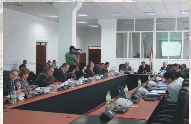
National Platform working group meeting.