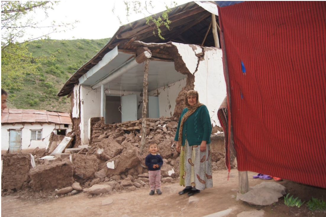
A house destroyed in Rubotnol Village, Childara Jamoat, Tavildara District