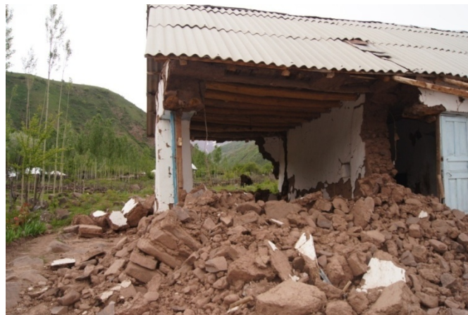
Figure 1; Partial collapsed house in Rubotnol village

The assessment team visited four houses, two in Kadara village and two in Langarak village ( Kalai Surkh jamoat, Rasht district) constructed after an earthquake in 2007 in using seismic reinforcement methods. One of the houses in Langarak village is right next to houses damaged as the result of the landslide. All four houses were in good condition. This indicates that the reinforcement techniques used in the four houses may have prevented seismic damage when compared to houses constructed in the traditional way. The Team suggests that more in depth analyses of the houses build in 2007 should be carried out to evaluate the seismic resistance of the model used.