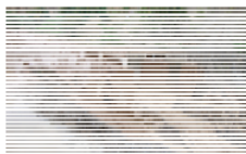
Sangiston, Zoosun, Putkhin and Tomin villages