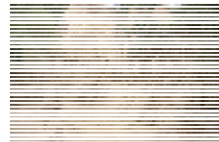
Села Сангистон, Зоосун, Томин и Путхин