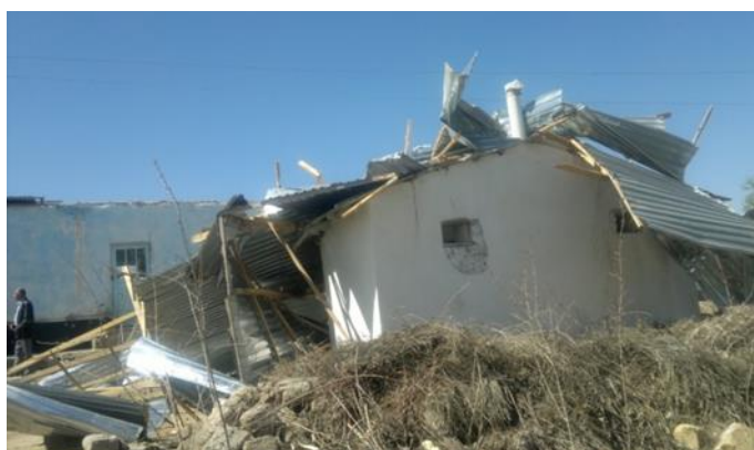
Affected social facility in Nosiri Khisrav district. Photo by CoES, 25 March, 2015