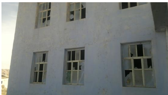
Affected kindergarten in Nosiri Khisrav district. Photo by CoES, 25 March, 2015