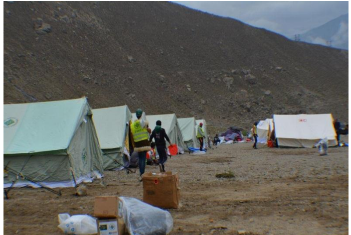
Tent camp for affected households in Shugnan District, GBAO, July 19, 2015

The President assigned the government agencies to coordinate relief and response operations in the areas affected by mudflow and surrounding districts. Local authorities have allocated land for construction of the houses for 83 affected families in Shugnan District. The construction of new houses for around 70 households has already started and laying of water pipe from the channel to the camp is ongoing. However, people at the affected site, whose houses were not affected and who was not evacuated (in Barsem and Berdibekobod villages), do not have access to drinking water and currently rely on drinking water that the volunteers from the communities are bringing.