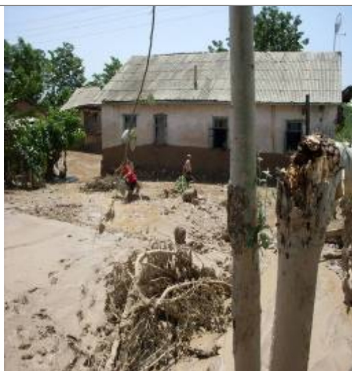
Mud destroyed not only houses and personal belongings but kitchen gardens.

The major donors to the DREF are the Irish, Italian, Netherlands and Norwegian governments. Details of all donors can be found on