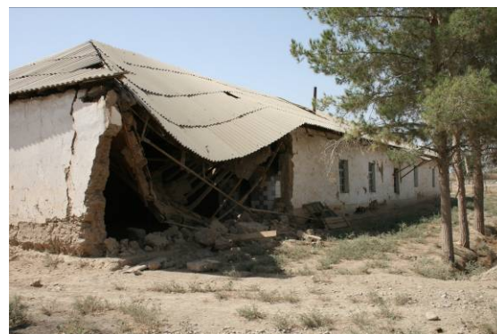
Tojiksoy school after the flood

The Grant Assistance for Grassroots and Human Security Projects of the Embassy of Japan awarded $95,425 for the rehabilitation of the school and the purchase of desks and chairs.